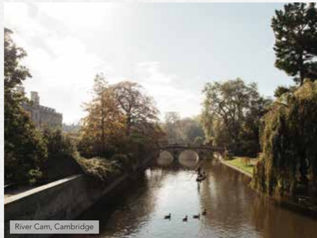
River Cam, Cambridge