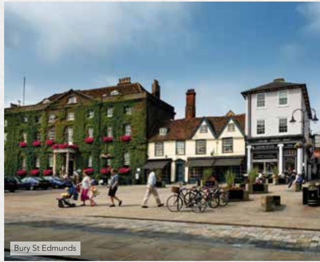
Bury St Edmunds