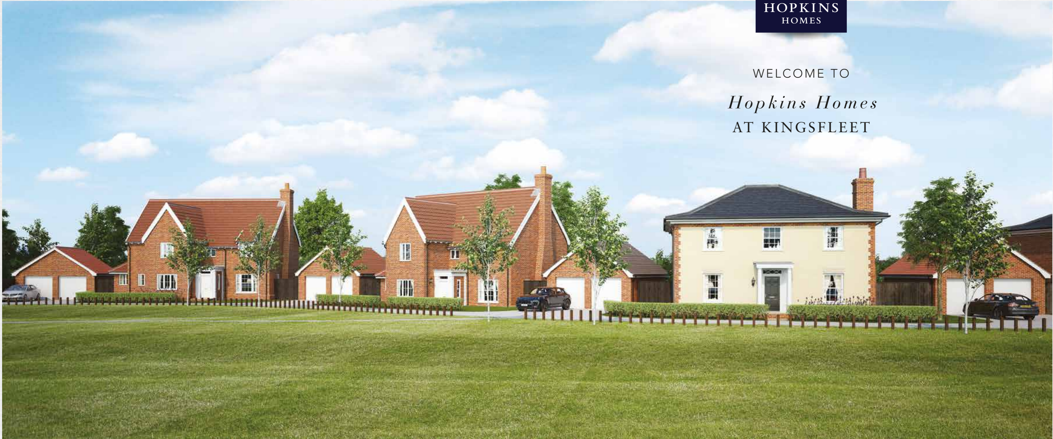
Computer generated image of properties at Kingsfleet. Indicative only, design, materials, and landscape treatments are subject to change.