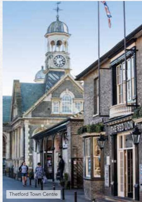
Thetford Town Centre